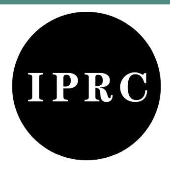
Independent Publishing Resource Center